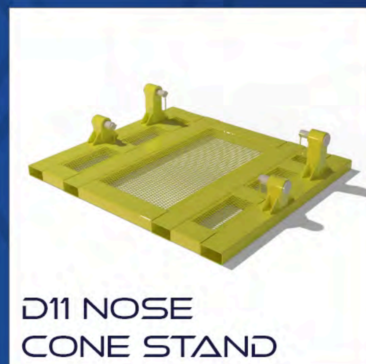
D11 NOSE CONE STAND