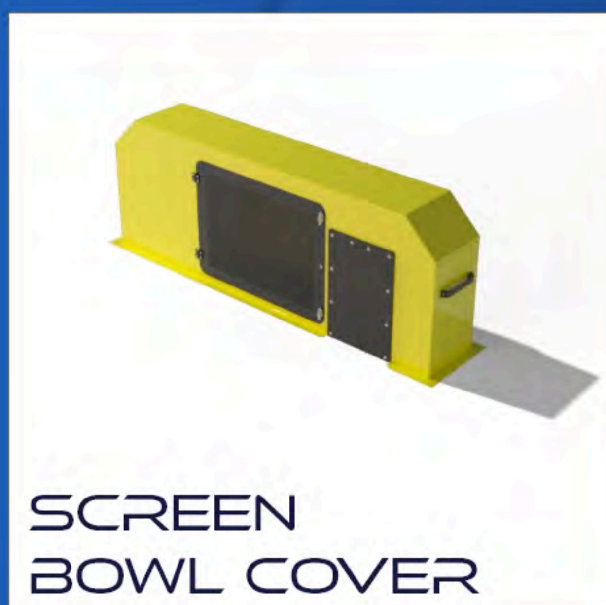
SCREEN BOWL COVER